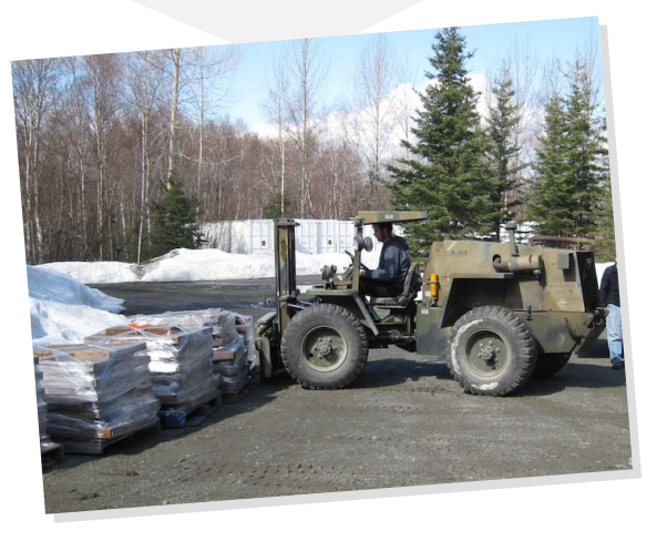
Unloading pallets of core donated by AES.

The three interns have been busy filling the remaining gaps in the GMC's hard-rock minerals inventory now that Eagle River has started to thaw. Approximately 90% of the mineral core at the GMC is stored in unheated, unlit shipping containers. The interns, with the help of staff member Kurt Johnson, look to close the gap on the remaining 30% of the undetailed hard-rock inventory.