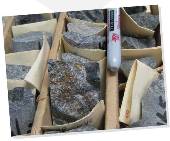
A portion of Orange Hill core, borehole 117.

Progress on a new GMC facility, The Alaska Earth Science and Data Center, is moving forward. The Department of Natural Resources is currently in promising negotiations with the potential, future land owner of the new facility. The Curator attended a successful meeting with the Alaska Minerals Coordination Group and gave a wellreceived presentation at the 2010 Geologic Mapping Advisory Board Meeting in Fairbanks. Feel free to download the <u>2009 DGGS Annual</u> <u>Report</u> for more information.