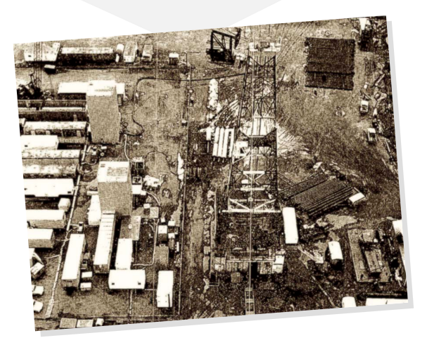
Ground zero drill area prior to the Cannikin explosion event on November 6, 1971.

The three interns have finished inventorying the oil and gas and minerals material located in the GMC's main warehouse basement. The basement contains wet cuts for several wells and more than 1,700 boxes of hard-rock mineral core. The Curator is also pleased to announce that 1-yr extensions have been approved for all three hard-working student interns.