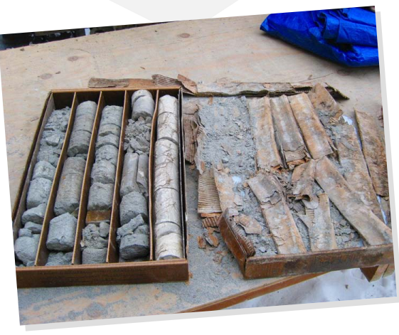
Results of reboxing Kashwitna Lake #1 (800'-810').

GMC interns Joseph Skutca and Kjol Johnson have obtained box-level details and performed quality control on 50% of the existing MMS oil and gas collection inventory. A test version of the GMC's material inventory in Google Earth format has been distributed to a small number of users in hopes of obtaining helpful feedback. Formal documentation for the inventory will also be included.